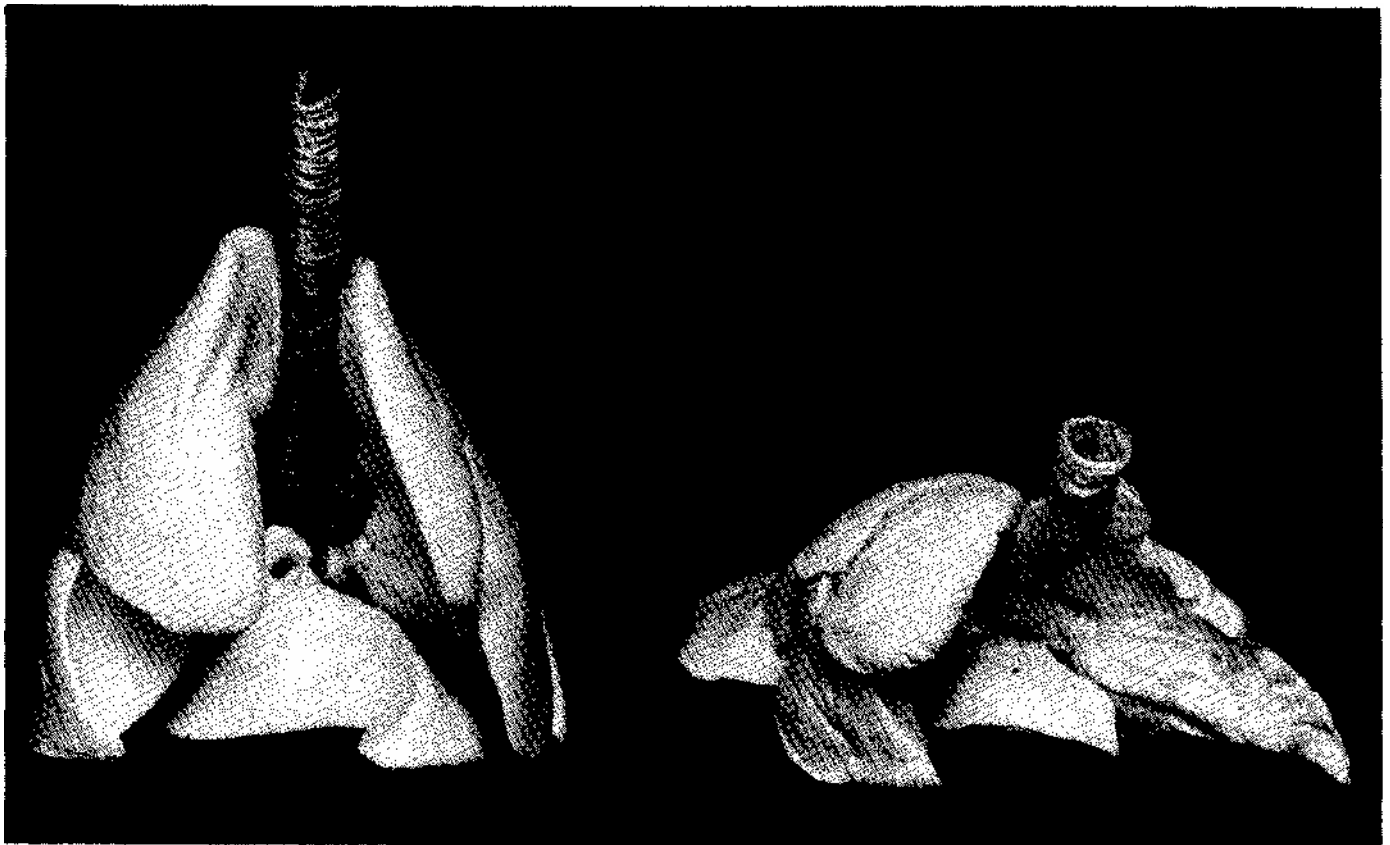
Figure 2: Cranial view of canine lungs (left), "forced air" impregnated using 30% xylene/70% polymer-mix and porcine lungs (right), vacuum impregnated using 30% xylene/70% polymer-mix. Anatomical relationships are not retained, as well in the vacuum impregnated lungs.

impregnated lungs were more flexible and spongy in texture. Hence, they may not be as durable, especially for student use. Canine and feline lungs were more flexible after impregnation than were porcine, ovine and bovine lungs. In all specimens, anatomical relationships were maintained (Fig. 1). Some specimens experienced areas of blow-outs during air drying and hence had areas which were not totally inflated. These lungs were not so beautiful, but still useful for teaching. Since air impregnation does not infiltrate dense tissues, the surface of the trachea must be coated as no polymer penetrates the dried cartilage. Hence, the trachea is hard and not flexible, whereas, vacuum impregnated lungs yield a flexible trachea (Fig. 2). All fat must be removed prior to air drying or the trachea will be greasy. Air impregnated lungs may not be as durable as vacuum impregnated lungs. However, the preservation of anatomical relationships is superior to vacuum impregnated lungs.